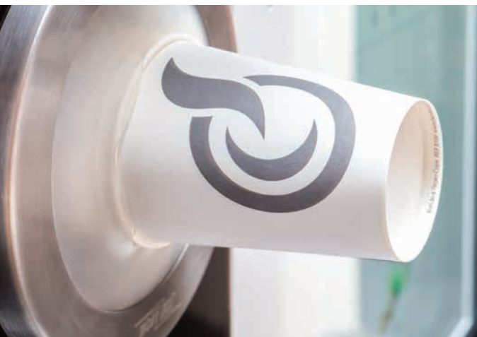
Manual cup dispenser for different sizes (diameter from 70 to 80 mm Ø).

In other words, DIVA creates an incredible coffee shop experience in places such as motorway service stations, shopping malls, airports and cinemas, as well as offering a new office solution for large companies.