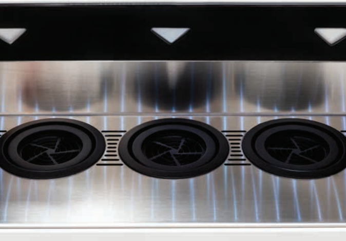
Cup station with 3 lifts to adjust the cup position according to the cup size.

MILK CIRCUIT CLEANING Since milk is a perishable product, DIVA automatically washes the milk circuits to prevent bacteria proliferation: the circuit is rinsed with cold water each time after the milk has been dispensed. The system also includes periodical automatic washing (programmable from 0 to 20 minutes from the last time milk is dispensed) which cleans the dispensing circuit, with the option to heat the washing water with steam.