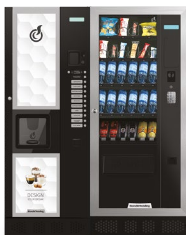
LEI400 + ARIA M MASTER

LEI400, automatic vending machine for hot drinks with 400 cups capacity.