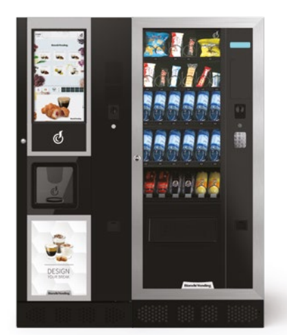
LEI400 TOUCH 21" + ARIA M MASTER

LEI400, automatic vending machine for hot drinks with 400 cups capacity. Designed to easily interchange the selection panel and adapt to different locations.