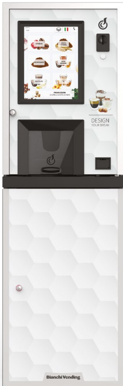
LEI250 TOUCH15" + CABINET STICKER KIT WITH "DESIGN YOUR BREAK" GRAPHIC (OPTIONAL)

TOUCH SELECTIONS SMART SELECTIONS EASY SELECTIONS