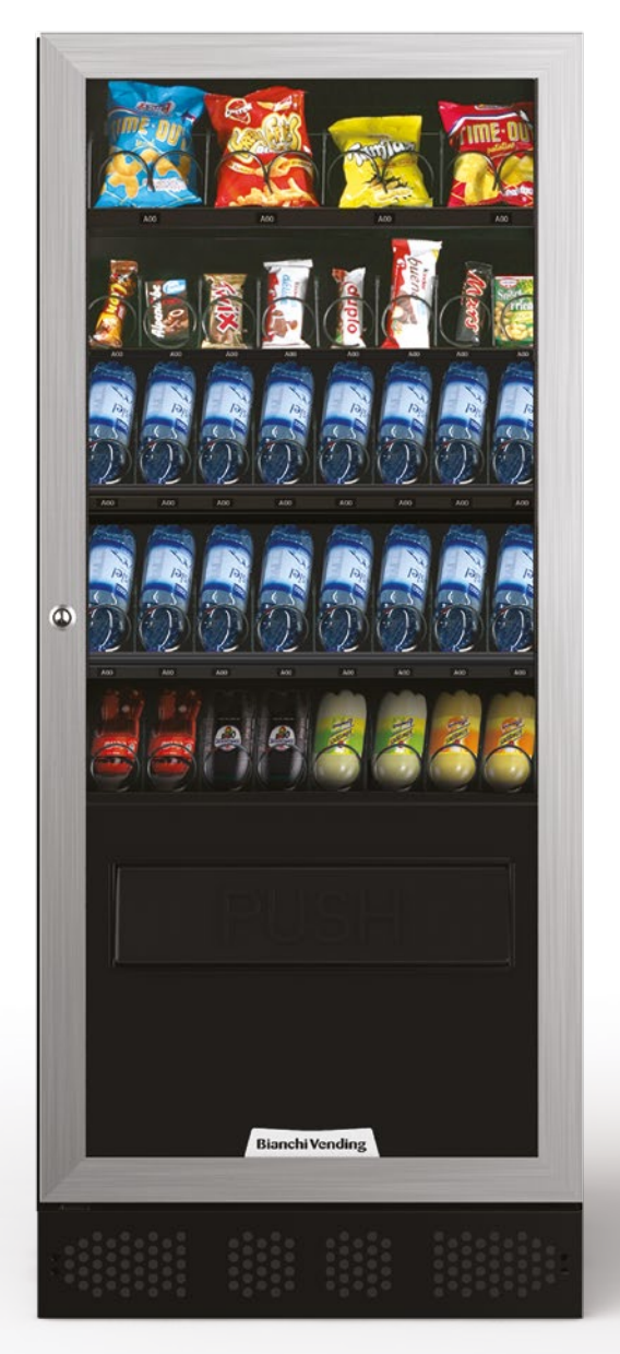
ARIA M SLAVE