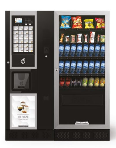
LEI400 SMART + ARIA M SLAVE

ARIA M, automatic spiral refrigerated 3° C vending machine for the sale of snacks, confectionary, sandwiches, yogurts and other fresh perishable foodstuffs, cans and bottles.