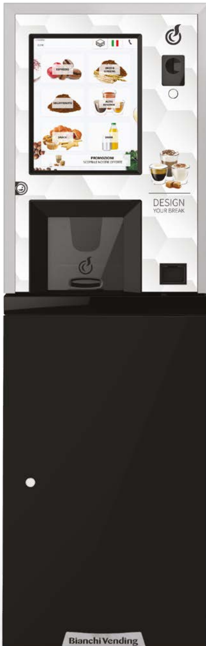
LEI250 TOUCH15* + CABINET STICKER KIT WITH "DESIGN YOUR BREAK" GRAPHIC (OPTIONAL)