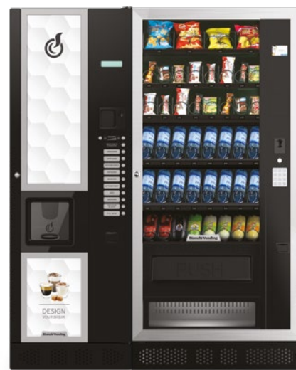
LEI600 + ARIA L MASTER

LEI600, automatic vending machine for hot drinks with 600 cups capacity.