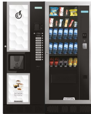
LEI400 + ARIA M MASTER

LEI400, automatic vending machine for hot drinks with 400 cups capacity.